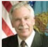
Edward T. Schafer Secretary of Agriculture U.S. DEPARTMENT OF AGRICULTURE