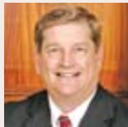
Charles H. Bronson Commissioner FLORIDA DEPARTMENT OF AGRICULTURE AND CONSUMER SERVICES